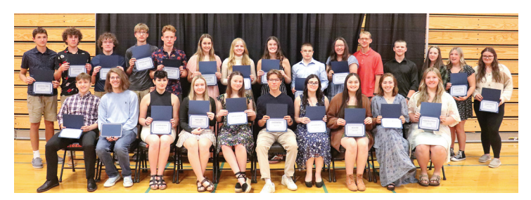
CLASS OF 2024