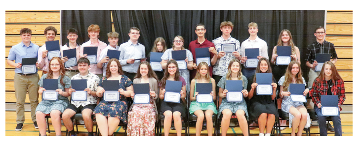
CLASS OF 2025