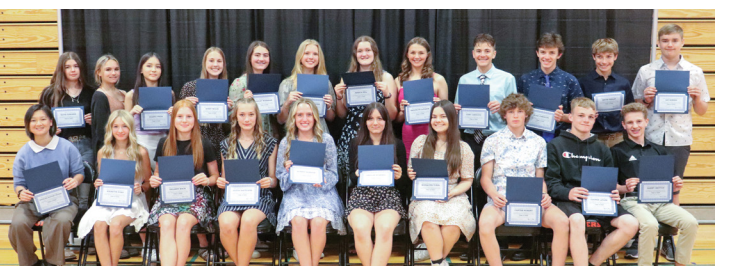
CLASS OF 2026