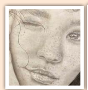
Close-Up Drawing by Nyah Pinzer First Place Grades 10-12

The hours and a full online gallery can be viewed at SalmonRiverFineArtsCenter.com.