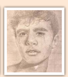
Guys Cry Too Drawing by Nyah Pinzer Honorable Mention Grades 10-12