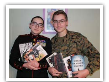
HS Super Regional Team